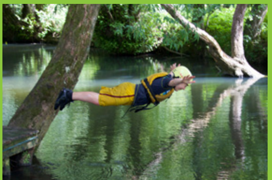
Thank you for another wonderful week at your fantastic centre. Children and adults alike are buzzing with memories of exciting activities, personal challenges, fabulous food and an incredibly supportive team to help things along.